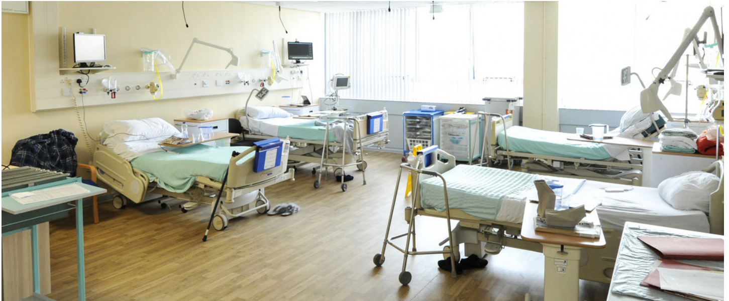
Woods' Simulation Ward, Medical Education Clinical Skills Suite

When you mix in time spent studying for the Postgraduate Certificate of Medical Education, becoming an ISCE examiner, and attending the ASPIH conference last November it has made for an exciting first six months. Thank you to all the staff who have been involved in teaching this year, and to the amazing Medical Education team without whom none of this would have been possible.